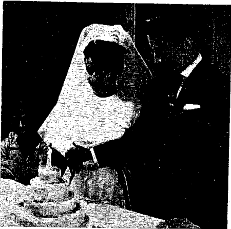
Cutting the Cake

In Colombia those who are not married in the Catholic church must be married by the judge in order for it to be legal. The Christians also have a church ceremony.