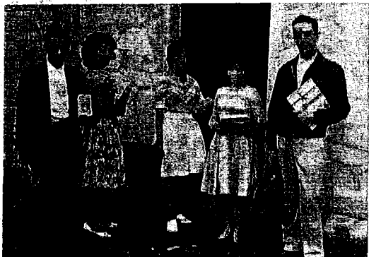
Two by two

Confronted with the Word of God--some people said, "I can't read." Others said, "I don't have any money." Still others were afraid to have anything to do with the Book. But the general attitude has changed greatly during the last two years and the people have become less frantic, more open, and ready to listen. They also dug into their pockets and bought literally hundreds of pesos worth of Bibles, Testaments, and Gospel portions.