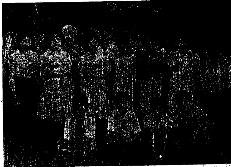
The graduating class with their two teachers.

This past school year the Lord has blessed the school with a fine teaching staff, enough workers, and a good group of students. During the spiritual emphasis week, as well as at other times of the year, many of the young people accepted Christ as Savior, and nine were baptized and became members of the church.