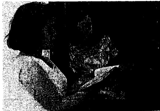
This is the Word of God

Two by two, young people and older members of our three churches went from house to house for three weeks in an endeavor to put the Word of God into the hands of every person. Town after town was invaded with the Word of God. First they went to Anolaima, then to La Mesa, La Esperanza, El Ocaso, Cachipay, La Florida, Anapoima, Apulo, and La Capilla.