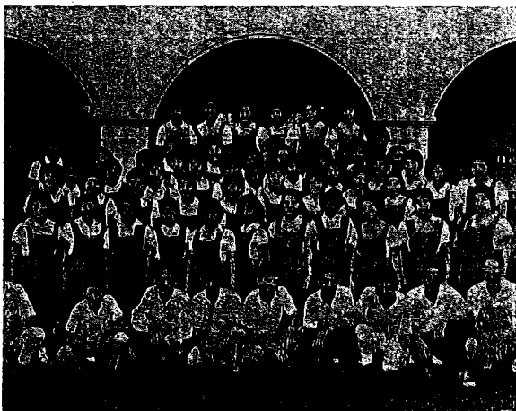
Normal School students in Ibague

church. In the afternoon the rest of the students go to 15 different homes in the city for Bible classes. As the students return from their classes they are bubbling over with new experiences and enthusiasm.