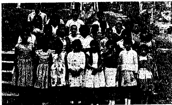
The graduating class