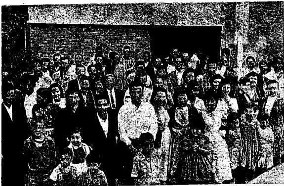
The retreaters were very happy.