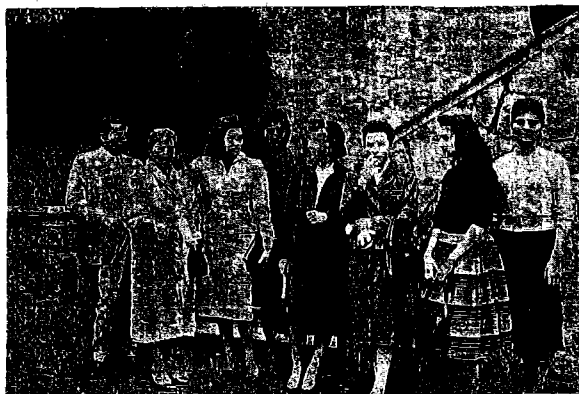
The small ones grew up.