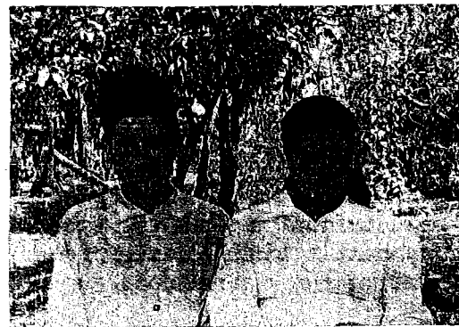
Marriage comes after wedded life.