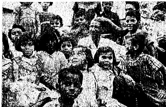
We struggle with them - and hope.

The other alternative is a civil marriage in the office of the local judge. This path is full of red-tape and many delays. The one who wants to get married declares himself separated from the official church. The judge notifies the local priest. The local priest then often makes an open scandal of the case and he is permitted to try to persuade the couple to return to the official church. If after about 30 days he has not been able to dissuade the couple, the judge can proceed with the plans for the wedding. He may,