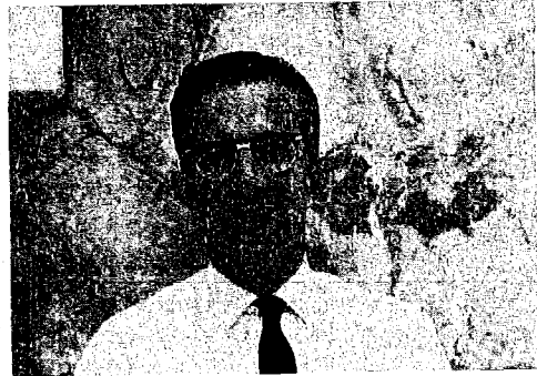
"We must move along."