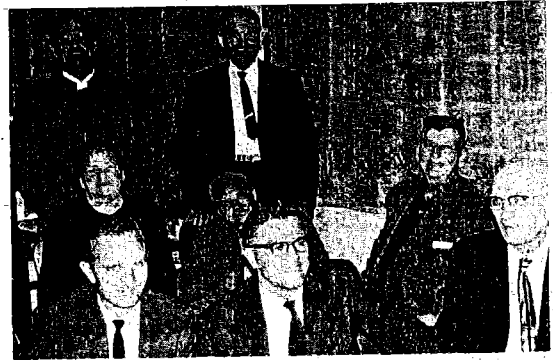
Menno Travel Service Tourists

Coming during the rainy season, they were greeted with the Tropical down-pours and slippery roads. The weather, however, did not seem to affect the good-natured spirit and interest shown in the work here. Their visit was a blessing to us and we wish to thank them for stopping in for the day.