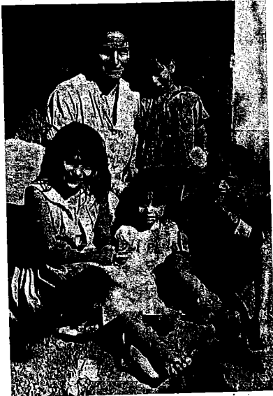
"He Has Blessed Us So"

From her own experience she knew how many pitfalls and temptations there were for the new Christian. Her husband, his family, her friends, and neighbors all told her that she was wrong to be interested in the Bible and the Protestant Church. Yet, within her heart she felt a satisfaction and an assurance that at last she had found the truth which kept her pressing on in her new life.